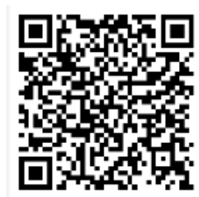
Figure(1) QR code

However, one disadvantage in using QR codes is that cybercriminals can target them. The QR code may direct users to suspicious websites, leading to the download of malware or viruses onto the victim's phone. Hackers can then potentially access sensitive information, such as personal information, social media accounts and passwords, and real-time location (3).