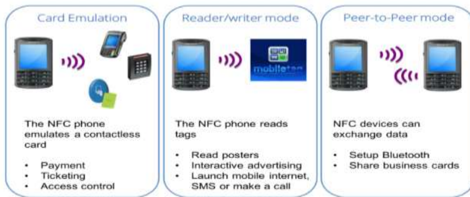
Figure 2 NFC operating mode

Near field communication (NFC)-based mobile payment is one of the newest and most popular mobile payment technologies. Portable devices are equipped with NFC tags, which can act as digital wallets, allowing customers to conduct transactions by waving their devices over NFC-enabled payment terminals and point-of-sale (POS) terminals (35), without requiring mobile networks or a power supply (36). The main benefits of NFC technology include its scope and availability, as it can be implemented on all existing mobile terminals by installing a chip, generating a wide range of new services for users and the terminals themselves. It has diverse applications such as billing, car payments, leisure activities, and more. NFC technology is easy to use since it only requires the parties involved to be within a specific proximity. It offers security by requiring manual activation or close proximity for payment, promoting proactive user behavior. It also generates value-added services, works on devices equipped with contactless features, serves as a platform for cash receipt, payment, and transportation worldwide. It is economically attractive due to its reliance on open standards without licensing fees (37). However, one of the disadvantages of NFC is that it requires modern smartphones equipped with a contact chip (27). Table below (table 3) summarize the difference between NFC and QR. Figure(2) illustrate the operating mode of NFC and uses of each mode