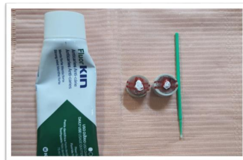
Figure (3): Application of sodium fluoride toothpaste.