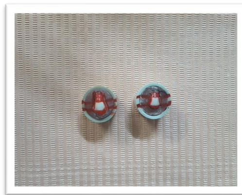
Figure (1): Creation of a window on the buccal surface to standardize the area of measurement in the middle third of the tooth.

All accompanying soft tissue and calculus were removed from the tooth by hand scaling, and then the enamel surface was polished using a rubber cup and a slurry of non-fluoridated pumice (PD, Germany) using a contra-angled low-speed hand-piece (11) . For every tooth sample, the hand piece's speed and polishing duration remained consistent. Then, the roots were chopped at the intersection of the cement and enamel using a straight diamond bur (Nti, Germany) on a high-speed hand piece (continuous water cooling) to protect the enamel. After that, each tooth crown was inserted into an auto-polymerized cold-cure acrylic resin from (Veracril, Colombia), which was then poured into a cylindrical plastic ring with a 14 mm diameter and 16 mm depth. The buccal surface of the ring was then oriented upward and parallel to the floor. The enamel surfaces were ground wet polished one by one with a fine grit silicon carbide paper (1200 grit) to yield standardized flat enamel surfaces (12) , and each sample's buccal surface had a circular 6x6 mm piece of adhesive tape applied in the center. After applying acid-resistant nail polish to the remaining surface, the tape was removed to show an enamel window (13) . Then, the exposed enamel window was polished with the universal polishing machine (Surf-Corder, Japan) as shown in figure 1. After that, all samples were kept in deionized water until they were soaked in a demineralized solution.