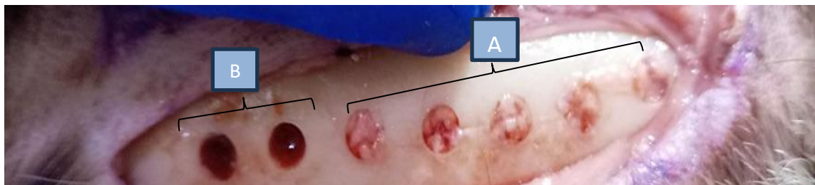
Figure (2): A- Five defects filled with platelet-rich side. B- Two defects filled with physiological clots.