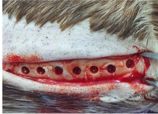
Figure (1): Seven standard bone defects of 4mm in width and depth with 5 mm apart on each side of the mandibular bone.

on the other side, and the last two defects acted as a control on both sides filled with a physiological clot. Before the wound was closed, the periosteum was replaced over the defects, A non-absorbable 3-0 black silk suture was used to close the wound, and the wound was treated with an antibiotic aerosol spray.