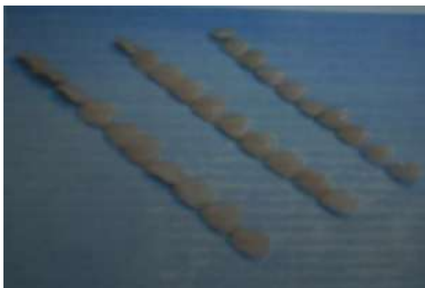
30 samples after ceramic condensation & glazing

Also the final thickness of the metal covered with ceramic can be determined by using metal gauge that was each labial surface of each sample checked on, in which the whole labial surface had the uniform thickness .