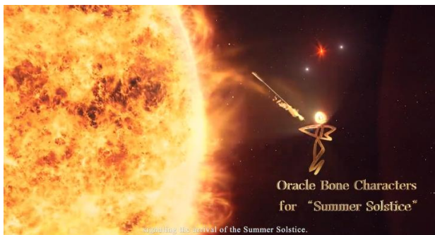
Picture 4. Sound waves of the sun

Using AI software such as Midjourney and Stable Diffusion, the program integrates Chinese classical poetry with various forms of Chinese opera, simulating the growth of plants and animals like cicadas and grass. These innovations allow modern audiences to view the growth processes of all living things from a new perspective.