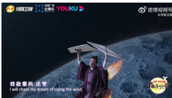
Picture 1. I Wish to Ride the Wind

The 2024 Mid-Autumn Fantasia features a dance segment, The Terracotta Warriors' Wild Night, in which dancers bring to life the terracotta figurines, such as the horse and camel riders, through graceful body language. These technological techniques seamlessly blend tradition and modernity, allowing the audience to feel the deep cultural fusion while enjoying the television program.