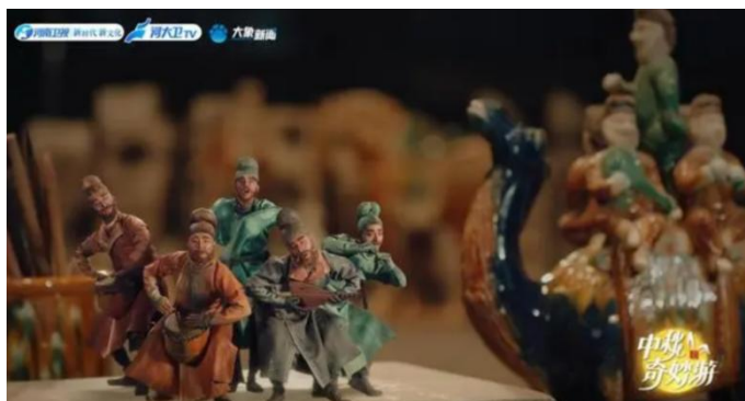
Picture 2. Horse and camel riders

The 2024 Mid-Autumn Fantasia features a dance segment, The Terracotta Warriors' Wild Night, in which dancers bring to life the terracotta figurines, such as the horse and camel riders, through graceful body language. These technological techniques seamlessly blend tradition and modernity, allowing the audience to feel the deep cultural fusion while enjoying the television program.