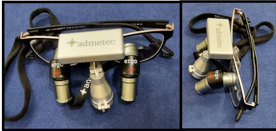
Figure 2: Ergo custom-made dental loupes 6X