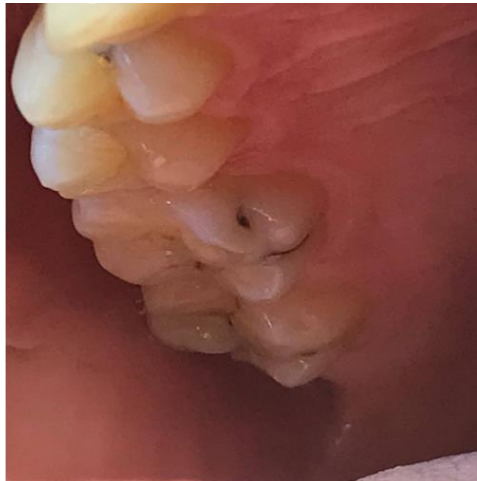
Figure (5): Prominent cusp infected with caries.