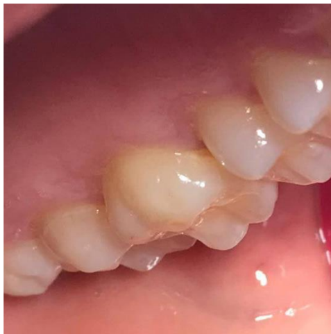
Figure (4): Maxillary first molar with smooth mesiopalatal surface.