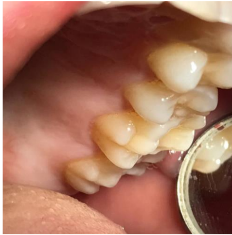
Figure (2): Maxillary first molar with prominent cusp