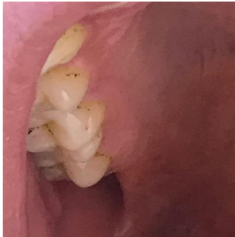
Figure (3): Maxillary first molar with groove in mesiopalatal surface.