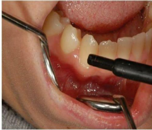
Figure 1: Air Stimulation Application