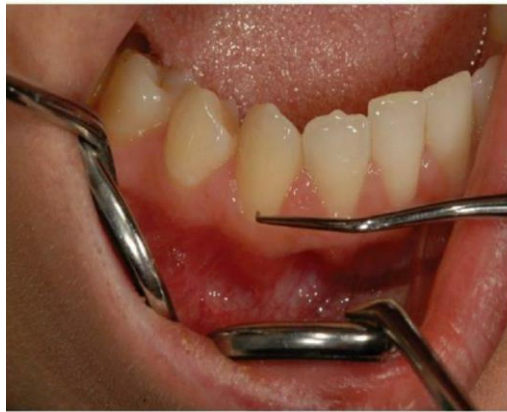
Figure 2: Tactile Stimulation