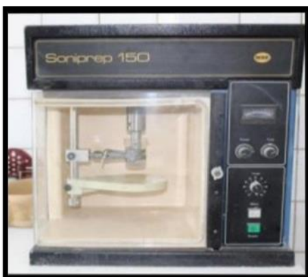
Figure (3): probe sonication