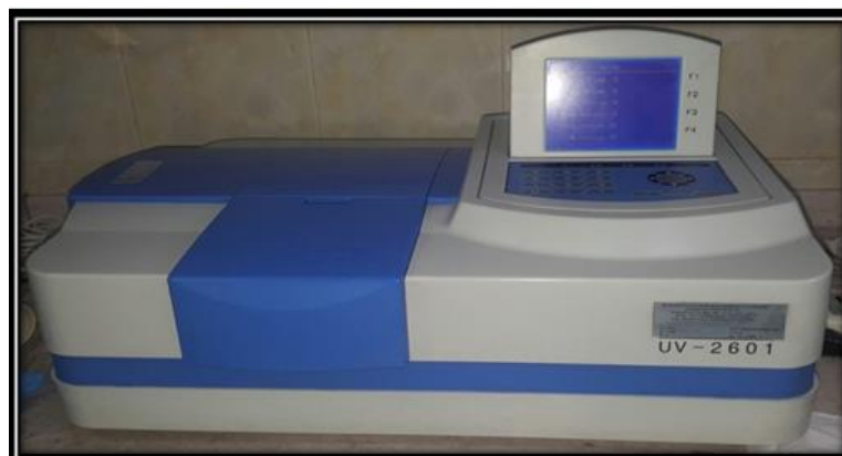
Figure (5): spectrophotometer (model UV- 2601) device