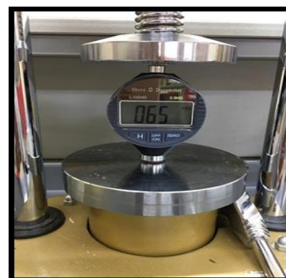
Figure (4): D_ shore device