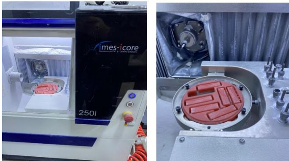
Fig. (1): CAD/CAM machine used to prepare the acrylic samples.