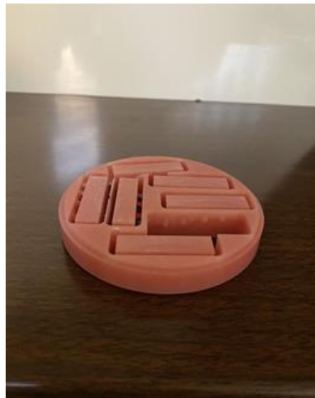
Fig. (2): CAD/CAM manufacturing PMMA specimens.