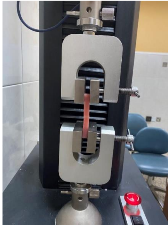
Fig. (3): Universal testing machine for tensile strength.