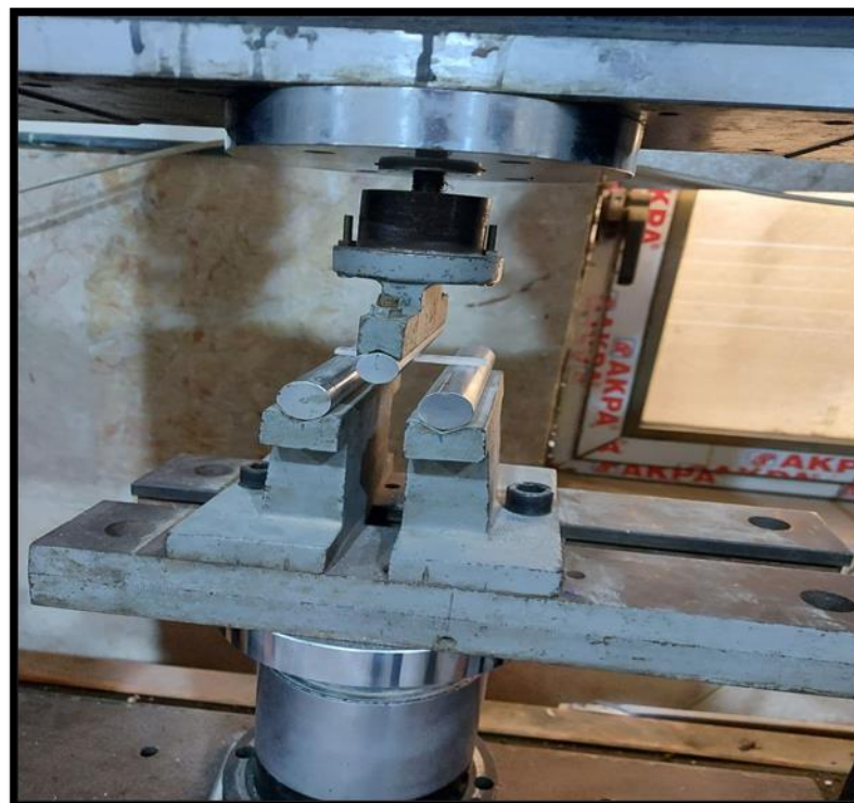
Figure (2) Sample under testing device