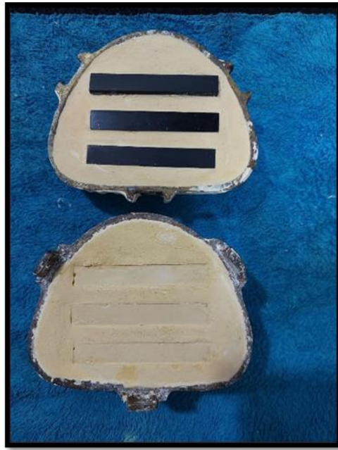
Figure (1) Two part of mold with dental stone and plastic pattern