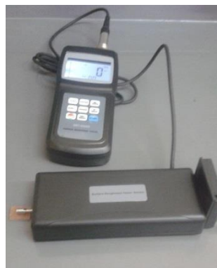
Fig. (3): specimen under roughness tester.