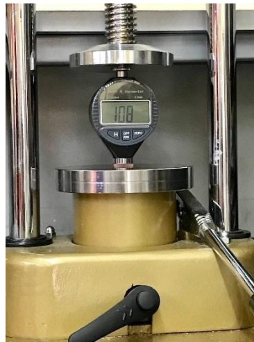
Fig. (2): specimen under hardness tester.