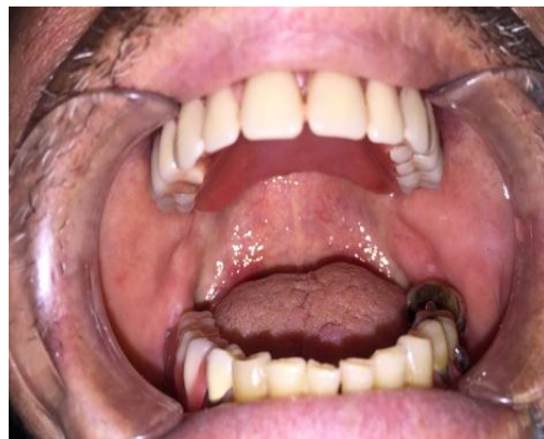
Fig. (8): waxed denture trial in the mouth