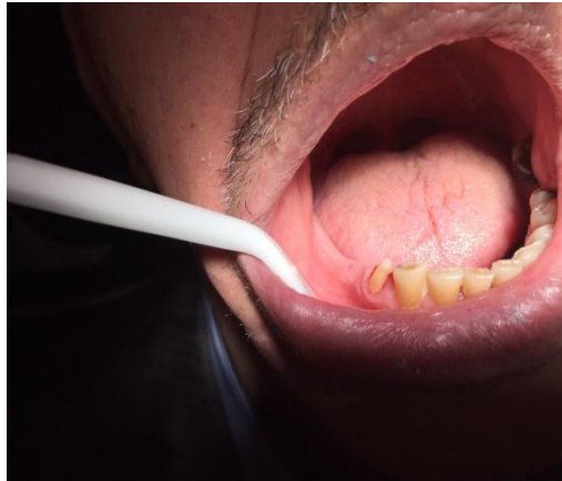
Fig.(3): Tooth preparation.