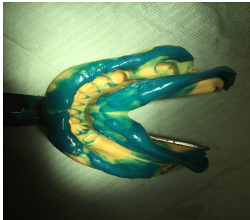
Fig.(4): Final impression.