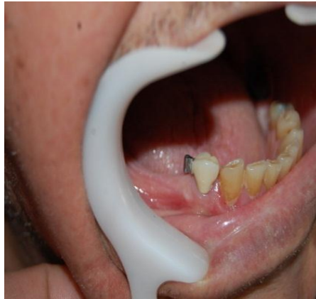
Fig.(6): PFM crown trial in the mouth.