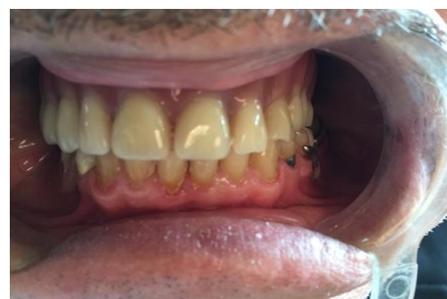
Fig. (9): final prosthesis in patient's mouth.