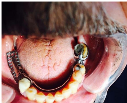
Fig. (7): partial denture frame trial in the mouth.