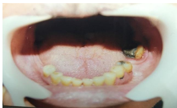
Fig.(2): Intra- oral picture