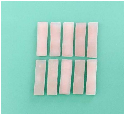
Fig. (2): Samples used in study.