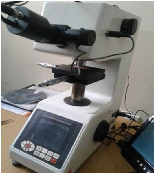
Fig. (4): Michrohardness test machine.