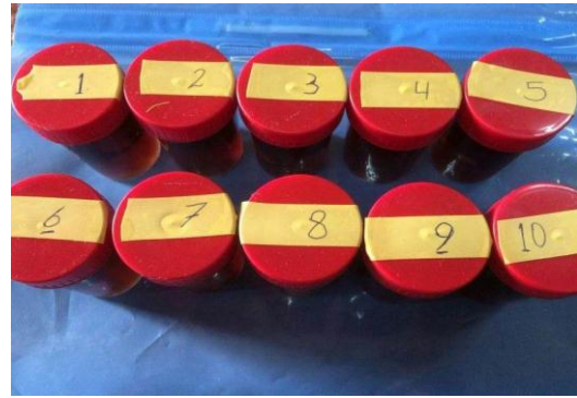
Fig. (3): Samples immersed in coca-cola