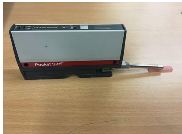
Fig. (5): Surface roughness device.