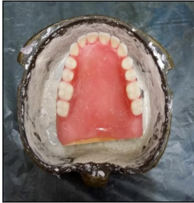
Fig. (1): Reduce the volume of the cast teeth with dental plaster