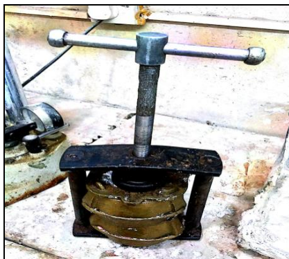
Fig. (5): The flasks placed in clamps