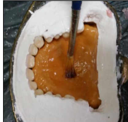
Fig. (4): Application of separating medium press by brush