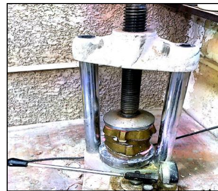
Fig. (6): Hydraulic