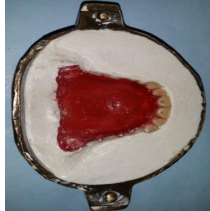
Fig. (2): Covering surfaces of denture