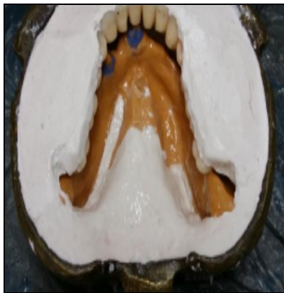
Fig. (3): Waximation