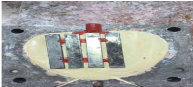
Fig. (1): wax sprues attached to metal patterns.

types of denture base would not affected by short time(90 minutes) immersion in cleaning and disinfection material.