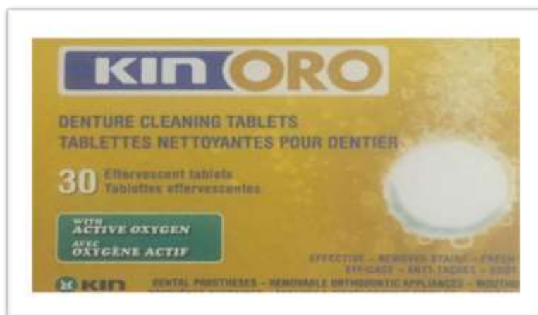
Fig(3):denture cleaning tablets/KIN