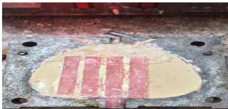
Fig. (2): samples after polymerization.