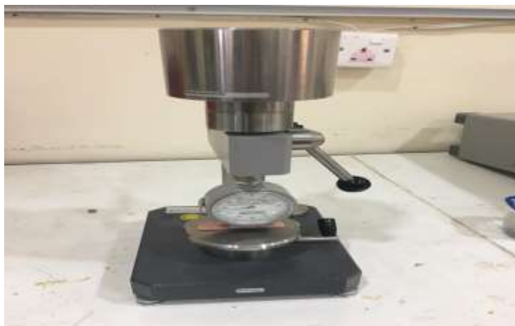
Fig. (4): Shore D hardness test machine