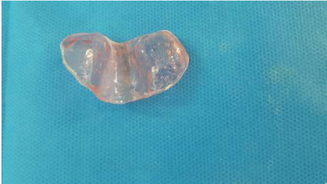
Fig (5): Feeding plate.