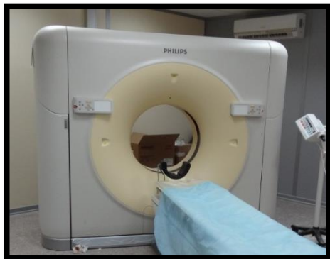
Fig.(1):- Multi-slice computed tomography machine (PHILIPS Brilliance 64) used for analysis of the specimens.