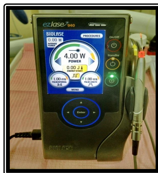
Fig. (1):- Laser device used in this study.

2-The lesion duration were significantly reduced to about 40% from that of control lesion.