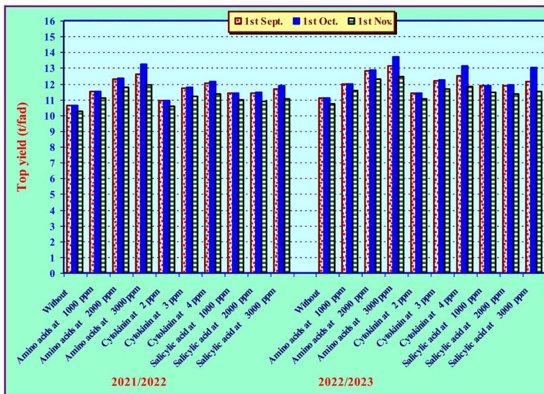
Fig. 2: Sugar beet top yield and fad as influenced by the timing of sowing and foliar spraying with anti-stress treatments in the 2021–2022 and 2022–2023 seasons.