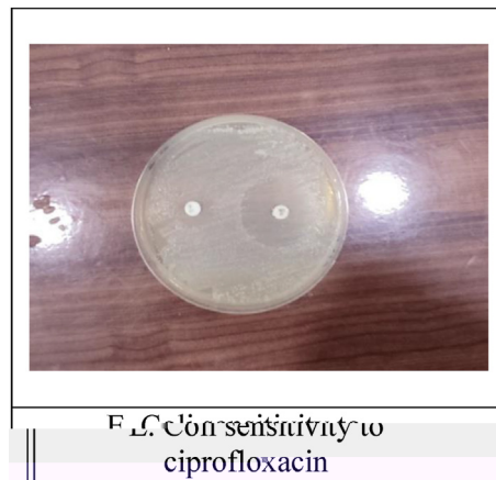
Fig. 3. E. coli sensitivity to ciprofloxacin.

UTIs are the most common bacterial infections during pregnancy. They are characterized by the presence of significant bacteria anywhere along the