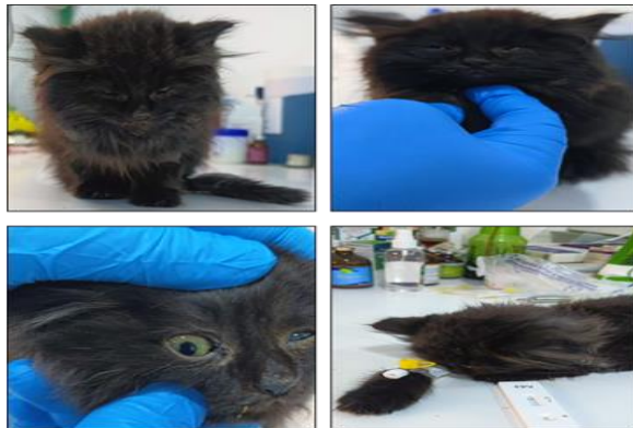
Figure 1: A Persian kitten, 3.5 months old, was brought to the Veterinary Teaching Hospital. The kitten died two hours after the medication started without responding.

A Persian kitten, unvaccinated, weighing 0.72 kg and 3.5 months old was brought to the Veterinary Teaching Hospital at Mosul University on March 19, 2025, initially exhibiting fever, lethargy, and anorexia. This was followed by vomiting, diarrhea, dehydration (8%), and hypothermia. Intramuscular vitamin B-complex (0.5 mL/kg), intravenous sodium chloride (0.9%) (43.2 mL/day) for dehydration, intravenous ampicillin (22 mg/kg) for infection, intravenous ondansetron (0.2 mg/kg) for vomiting, and supportive care in a warm environment were used as treatment. The prognosis remained poor because of the severity of the disease, even with this intensive therapy that was started right away. Two hours after the start of medication, the kitten died without responding (Figure 1).