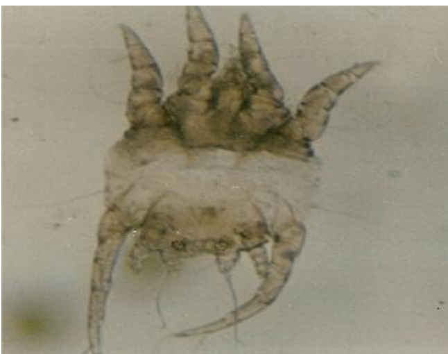
Figure (5) Psoroptes male