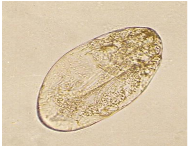
Figure (4) Sarcoptes egg X 250