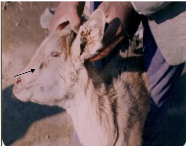
Figure (3) Goat infestated with mange at the face and ear