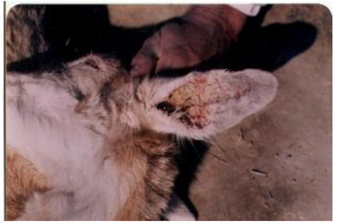
Figure (2) Goat infestated with mange at the face and ear and neck