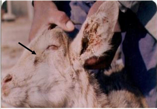
Figure (1) Goat infestated with Mange at the face and inside ear