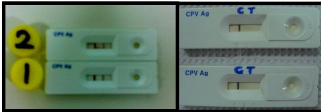
A- B- Fig. (1) Rapid test kit for detection CPV antigen (A=positive results, B=negative results) C control, T test