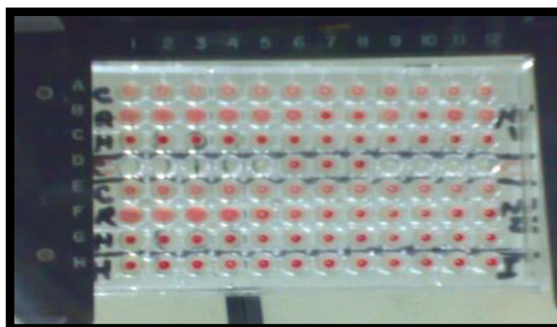
Fig. (3) Haemagglutination test of CPV with canine (C), rabbit (R) and horse (H) RBCs (negative for horse RBCs)