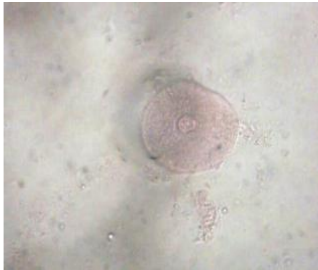
Fig. (4) Oocyst of Monocystis sp. 40x