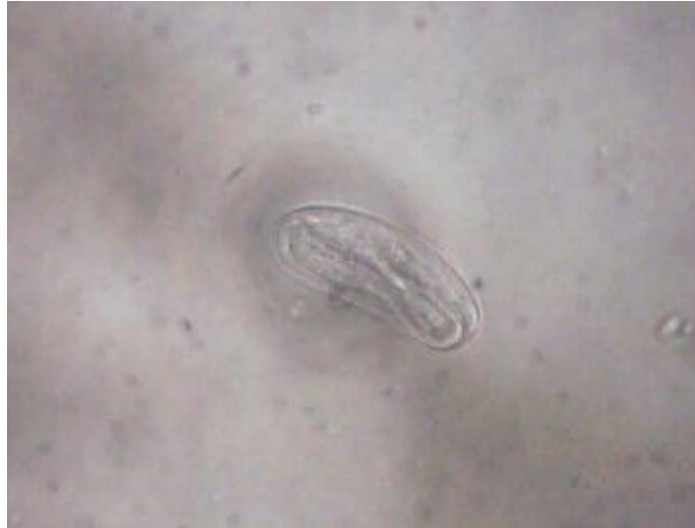
Fig. (3) Larvae inside egg of Heterodera sp. 40x