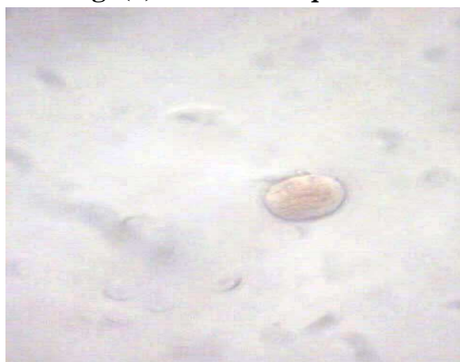
Fig. (5) Ascaridia sp. 40X