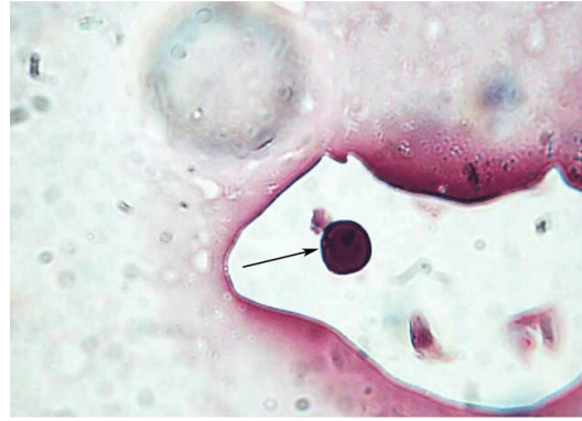
Fig. (10) Oocyst of Cyclospora sp. 100X