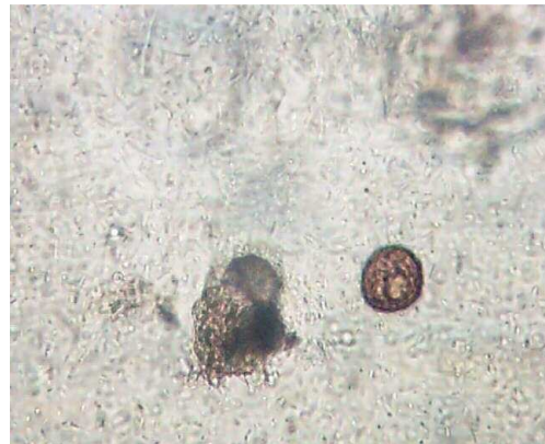
Fig. (2) Entamoeba histolytica 40X.