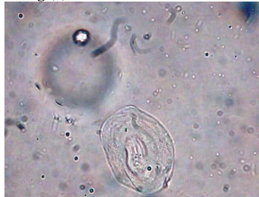
Fig. (6) Strongyloide sp. 40X