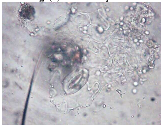
Fig. (7) Habronema sp.40X