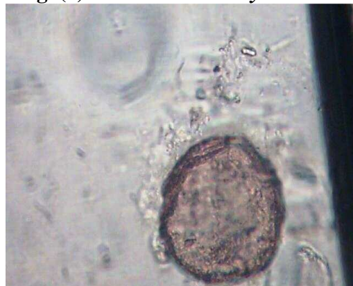
Fig.(4) Ascaris lumbricoides .40X