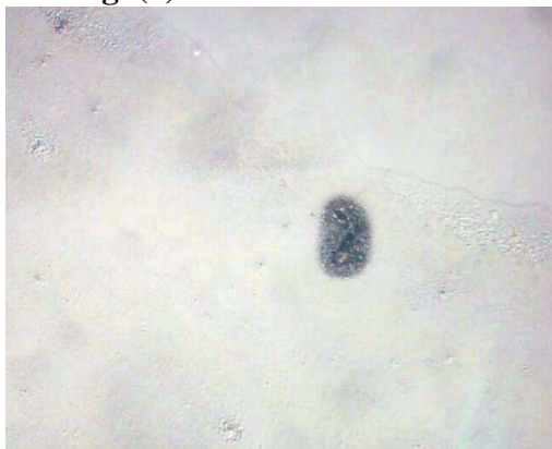
Fig. (3) Iodamoeba sp. 40X.