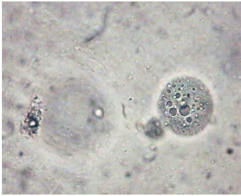
Fig. (1) Entamoeba coli 40X.