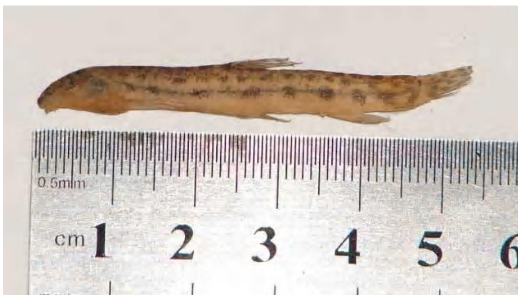
Plate (1). Specimen of Cobitis linea (Heckel, 1849) collected from Huweza marsh during July 2007 .