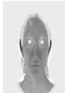
Figure(3) Ghost Image

This formula is designed to emphasize pixels with high Cb and make the pixels with lower Cr weaker and causes the pixels with high Cb and low Cr brighten, Figure (3) shows the ghost image.