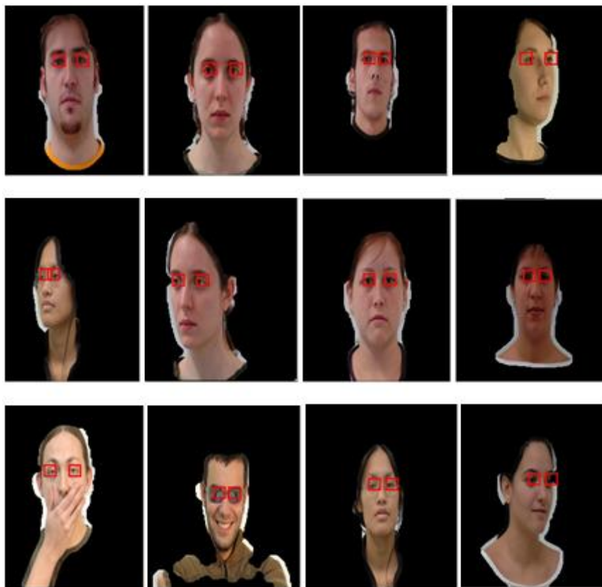
Figure (5) Sample of true detection