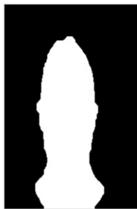
Figure (2) Binary Image of Skin Area

Once the skin color area is localized the resultant image is converted to binary image. The process of erosion and dilation is carried out to remove unwanted pixels which were falsely detected as skin color pixels as shown in Figure (2).